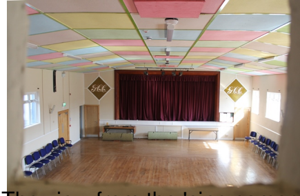
The view from the 'cine camera' area