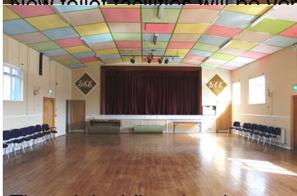
The original floor has been preserved and polished and the quaint ceiling remains intact.