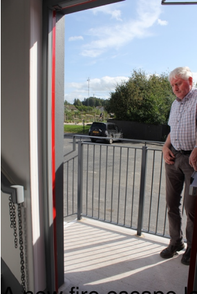
new fire escape leading to the car park