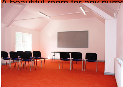
This second meeting room is just off the previous room.