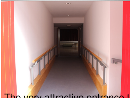
The very attractive entrance to the hall