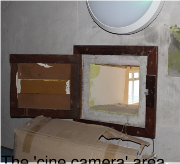
The 'cine camera' area