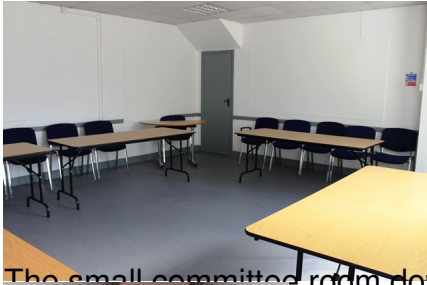
The small committee room downstairs has been beautifully refurbished