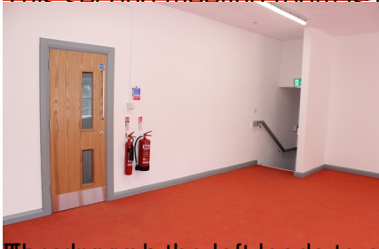
The door on the left leads to a small area where the cine camera would have been 'housed' in the old days.