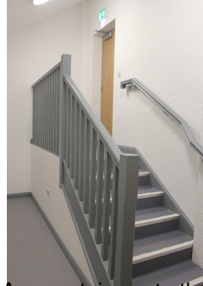
A new stairway to the stage and a changing area for performers