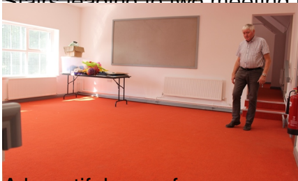
A beautiful room for any purpose - bright and cheerful.