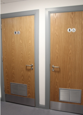
Separate toilets for performers