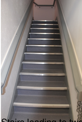
Stairs leading to two meeting rooms