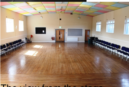
The view from the stage